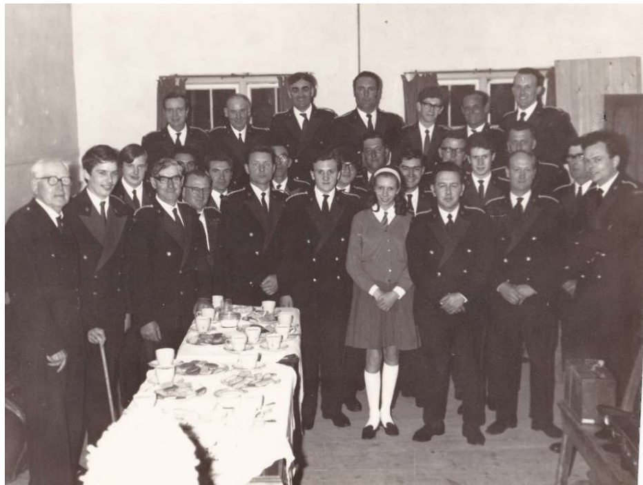
The Band at Fowlmere for a concert circa 1969