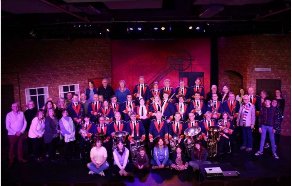
The Band with the Viva Arts Company taking part in 'Brassed Off' at Soham Village College in 2017. A sell out success at the Performing Arts Centre.

In September of 2017 we worked with Soham's accomplished Viva Arts organisation to provide a band for a production of 'Brassed Off' in the Performing Arts Centre at Soham Village College; this proved to be a sell-out success. Although a new venture for most of us, a few members of the current band had taken part in the professional production at the Arts Theatre Cambridge in 1999.