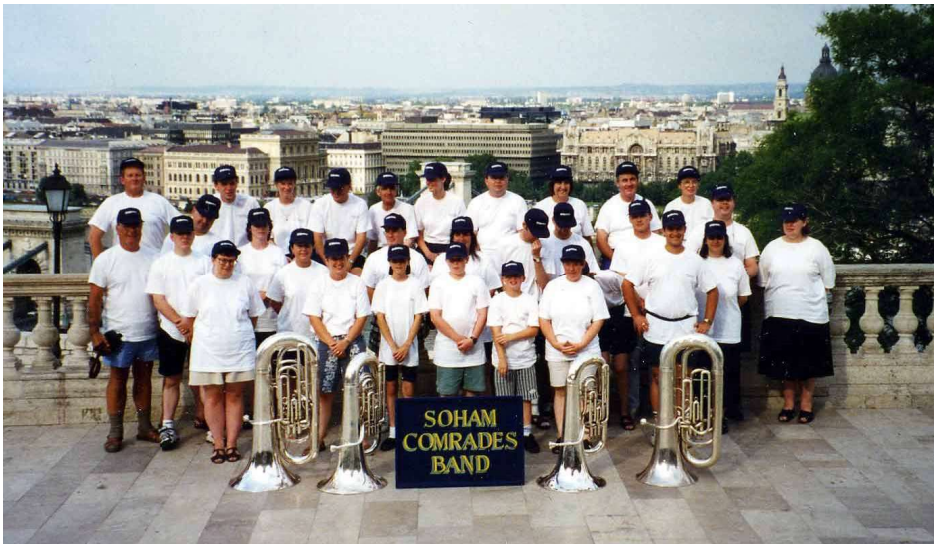
The Band on tour in Hungary - 1996

1996 five Band members plus friends travelled by ferry to Guernsey where they took part in a concert with the Guernsey Concert Band. Later in the year the Band travelled by coach on a ten-day tour to Hungary to perform at various venues including: Szeged (twin town of Cambridge), Sandors Palace in Budapest and Bekescsaba where the Band took part in the Zenit 96 Festival. The festival competitions were a mix of brass and wind bands which proved a problem to some of the judges, but Soham's contribution was greatly appreciated.